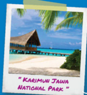
"KARIMUN JAWA NATIONAL PARK"

Situated some 90km northwest off the northern coast of Jepara Regency in Central Java Province, the Karimunjawa Archipelago is a chain of breathtaking coral-fringed islands replete with underwater splendor secluded in the open Java Sea. Here, the white beaches are sublime, swimming is wonderful, snorkeling is extraordinary, and the pace of life relaxed as a destination defined by coconut palms and turquoise seas.